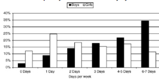
Figure 1. Frequency of electronic game play in days per week, by gender, among 7th and 8th grade students who had played games within the previous 6 months ( n = 1137 ).

Source: Cheryl Olson, ScD, et al., "Factors Correlated with Violent Video Game Use by Adolescent Boys and Girls," Journal of Adolescent Health , Jan. 2007